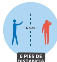
6 PIES DE DISTANCIA

Evite esta área si tiene tos o fiebre o si experimenta síntomas del virus.