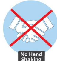
No Hand Shaking

Sneeze or cough into a tissue, or into your elbow; place used tissue in the trash