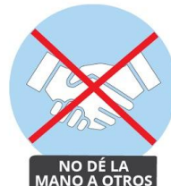
NO DÉ LA MANO A OTROS

Estornude o tosa. en un pañuelo de papel o en el codo; coloque los pañuelos usados en la basura